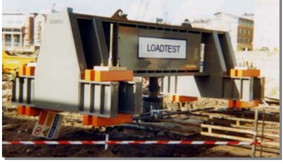
Figure 4. 4 MN CRAFT set up on 4 anchors with 4 Dywidag bars

Illustrated in Figure 1 is an arrangement capable of providing up to 12 MN. It which can be placed on anchors on a 4 \times 4 \text{ m} arrangement for maximum capacity or at a reduced maximum test load capacity can be used with 4 anchors placed symmetrically within a 7 x 7 m grid.