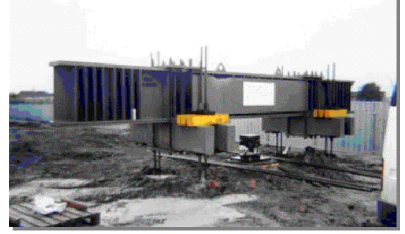
Figure 5. 5.5 MN CRAFT set up on 4 anchors with 8 Dywidag bars

The 5.5 MN arrangement requires 4 anchors arranged on a 4 \times 1.5 m or 4 \times 2.5 m. The spacing of the secondary beams can be increased to 5 m but with a reduction in maximum capacity.